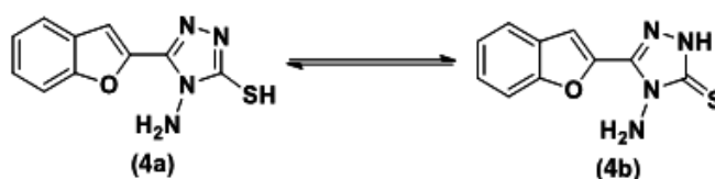
Fig. 2 Tautomeric transformation of 4-Amino-5-(benzofuran-2-yl)-1,2,4-triazole-3-thiol (4a) and 4-Amino-5-(benzofuran-2-yl)-2,4-dihydro-1,2,4-triazole-3-thione (4b)

Alternatively, the reaction of carbohydrazide with benzaldehyde derivatives in acetic anhydride gave N' -acetyl-1,3,4-oxadiazole derivatives [25]. Following the description from the literature, compound (3) was refluxed with 4-fluorobenzaldehyde, and the product was purified for further NMR analysis. Besides ^1\text{H} and ^{13}\text{C} signals of benzofuran, interestingly, 2 singlet signals on ^1\text{H} -NMR ( \delta_{\text{H}} 9.95 and 10.54) and 2 signals on ^{13}\text{C} -NMR ( \delta_{\text{C}} 168.5 and 157.4) were obtained, that could be attributed to hydrogen in carbohydrazide group -\text{NH}-\text{NH}- and carbon in two carbonyl groups, suggesting the formation of N' -(4-fluorobenzoyl)-1-benzofuran-2-carbohydrazide (6) instead of 1-(5-(benzofuran-2-yl)-2-(4-fluorophenyl)-1,3,4-oxadiazol-3(2 H )-yl)ethan-1-one (5) (Scheme 3). This interesting phenomenon might be attributed to the fluoro group.